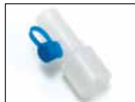
T-connectors for Intubated monitoring